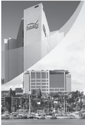
Hoag Hospital has stood for excellence in medical services for more than 50 years

Hoag is a not-for-profit regional healthcare delivery network in Orange County, Calif. consisting of two acute-care hospitals, seven health centers and a network of more than 1,300 physicians, 5,000 employees and 2,000 volunteers.