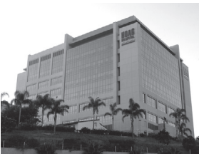
Sue and Bill Gross Women’s Pavilion at Hoag Hospital Newport Beach