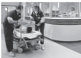
Over 200 patients are treated in the emergency department each day

Emergency room care also plays a key role, as approximately 42 percent of the hospital's inpatients come through the emergency department. In addition to the increased space and equipment added during a 1995 renovation, Hoag's emergency efforts are supported by life-flight helicopter services and a paramedic radio base station. In 2009, there were 73,000 emergency department visits, meaning the emergency department staff treats over 200 patients each day.