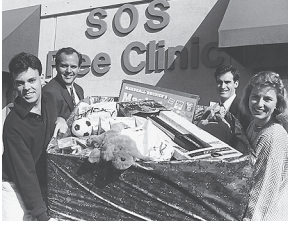
Hoag Hospital is a major partner with SOS

Through Hoag's Community Medicine program, the hospital sustains the steadfast community service values that have been so vital to its growth and success. As an integral partner with more than 70 local community organizations, Hoag reaches out to its neighbors and helps ensure proper health care for those who are truly in need. These collaborations are targeted at improving the community's overall health primarily through disease prevention and health promotion. Additional alliances are continually being developed to enhance and coordinate available wellness services in the community, especially those for vulnerable and disadvantaged populations.