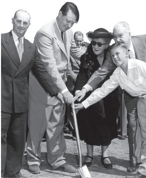
Hoag Hospital's groundbreaking ceremony in September 1951